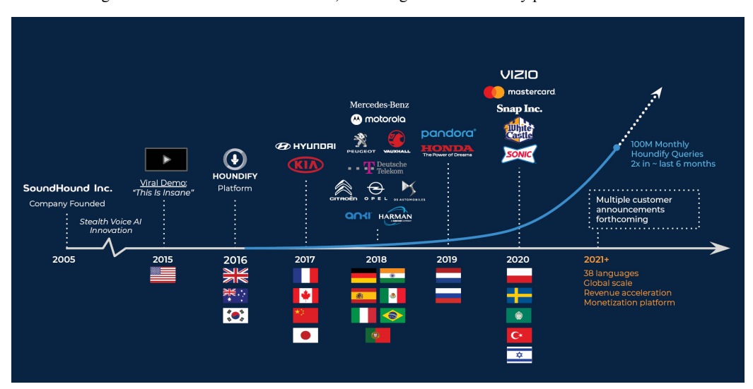
Building a Diverse, Global Customer Base

Our entry into the Voice AI space began with 10 years of constant innovation in "stealth" building disruptive technologies in Voice AI using innovative approaches. Our goal was to build a differentiated Voice AI technology that we fully own and which is significantly better than other solutions in the market. We achieved that goal and unveiled the result in 2015, launching it as the Houndify platform in 2016.