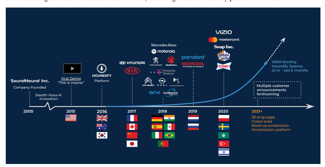
Building a Diverse, Global Customer Base

Our entry into the Voice AI space began with 10 years of constant innovation in "stealth" building disruptive technologies in Voice AI using innovative approaches. Our goal was to build a differentiated Voice AI technology that we fully own and which is significantly better than other solutions in the market. We achieved that goal and unveiled the result in 2015, launching it as the Houndify platform in 2016.